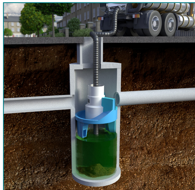
Fig 3. Maintenance is done with a vector truck

Go to hydro-int.com/sizing to access the tool.